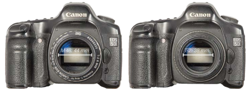
The M48-thread provides a free aperture of 44 mm diameter, which is sufficient even for full-frame DSLRs. The free aperture of 38 mm provided by the common T-2-thread is sufficient for APS-C-cameras.