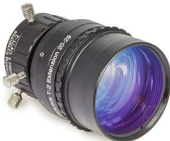
MPCC V-1-Set #2458403

With T-2 and M48 thread or photography with all Newtonian telescopes