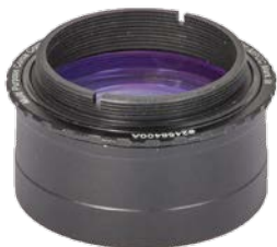
MPCC base element #2458400A

The only coma-corrector for Newtonian telescopes which does not increase the focal length. An f/4 Newton stays an f/4 Newton!