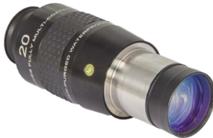
The field stop of the Explore Scientific 20 mm 100°-Okular is deep inside of the housing. The MPCC can be attached directly with the M48-thread.