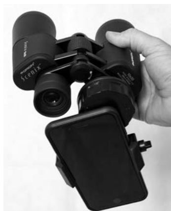
Figure 6. The SteadyPix Quick can be used with binoculars, as shown here, or spotting scopes or even monoculars.

You'll need a steady atmosphere, i.e., good "seeing," to get sharp planetary images. The smartphone's display will allow you to show off your target object to friends and passers-by -- no waiting in line at the eyepiece!