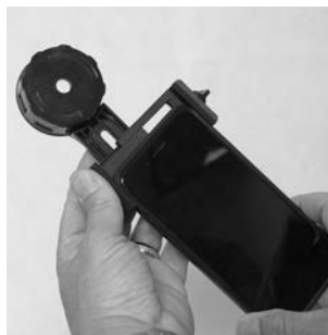
Figure 2. The adjustable bracket can open wide enough to hold even large cell phones. The phone clamps in place securely thanks to rubber padding and inward-angled side rails.