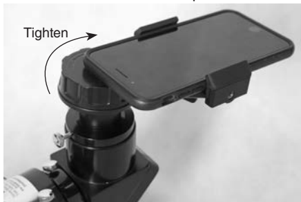
Figure 5. Place the turret over the eyepiece of your instrument (a) and turn the turret's twist-tight housing until it firmly grips the eyepiece (b) .