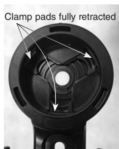
Figure 4. Turn the turret's housing until the clamp pads are wide open (flush with turret's inside edge).

For a telescope or spotting scope eyepiece, it may be easier to remove the eyepiece from the scope and install it in the turret first, then re-insert the eyepiece in the scope with SteadyPix Quick and phone attached. Binocular eyepieces are not removable.