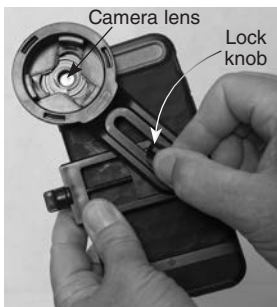
Figure 3. Align your phone's camera with the hole in the turret.